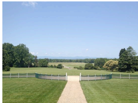
Facing the Blue Ridge Mountains from the front doors of Montpelier, where the majority of the estate's 2,650 acres have been placed under conservation easement.

"What you do--the painstaking, day-to-day conversations with your friends and neighbors about how best to take care of this place you love and live--the bones of very old mountains--is how all true, great work is truly accomplished. . . acre by acre, person by person, sometime glacially slow, sometimes sweeping along but always inexorably."